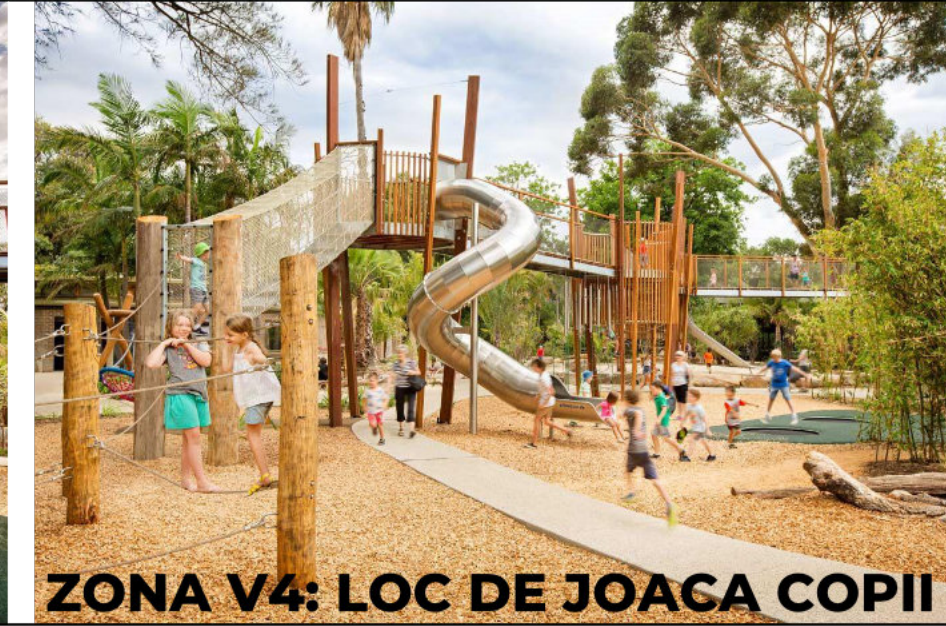
ZONA V4: LOC DE JOACA COPII