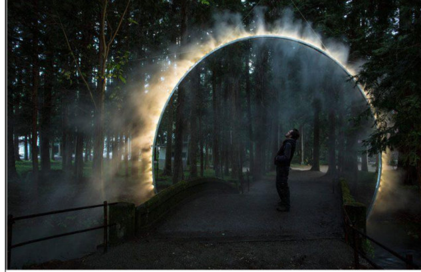
ZONA VI: AGREMENT SI SPATII VERZI