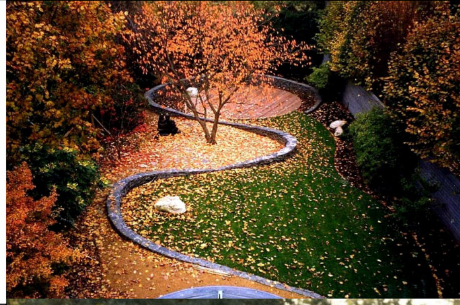
ZONA VI: AGREMENT SI SPATII VERZI