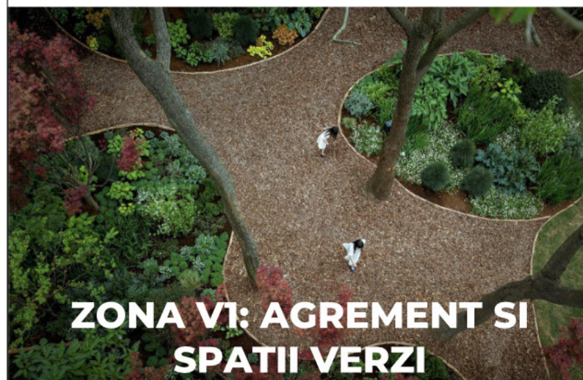
ZONA VI: AGREMENT SI SPATII VERZI