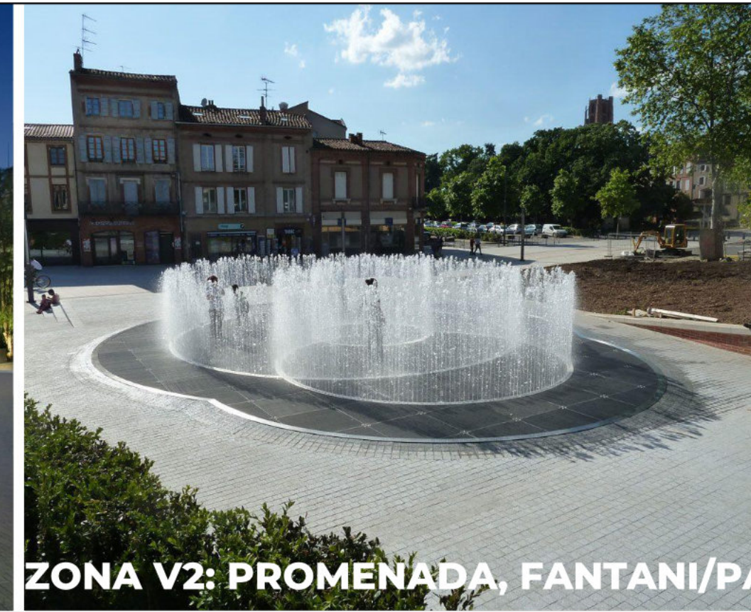
ZONA V2: PROMENADA, FANTANI/PATINOAR